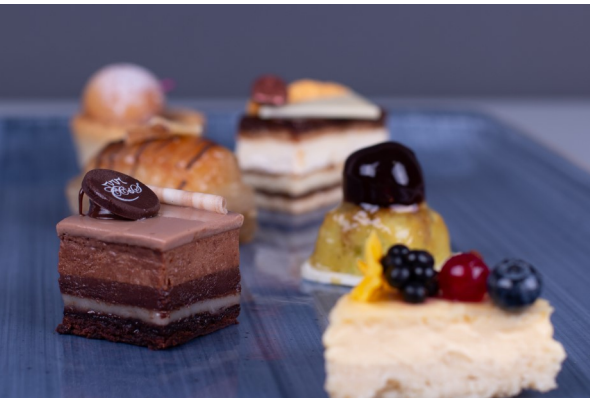
Minimum order of 15 persons Service Staff not included